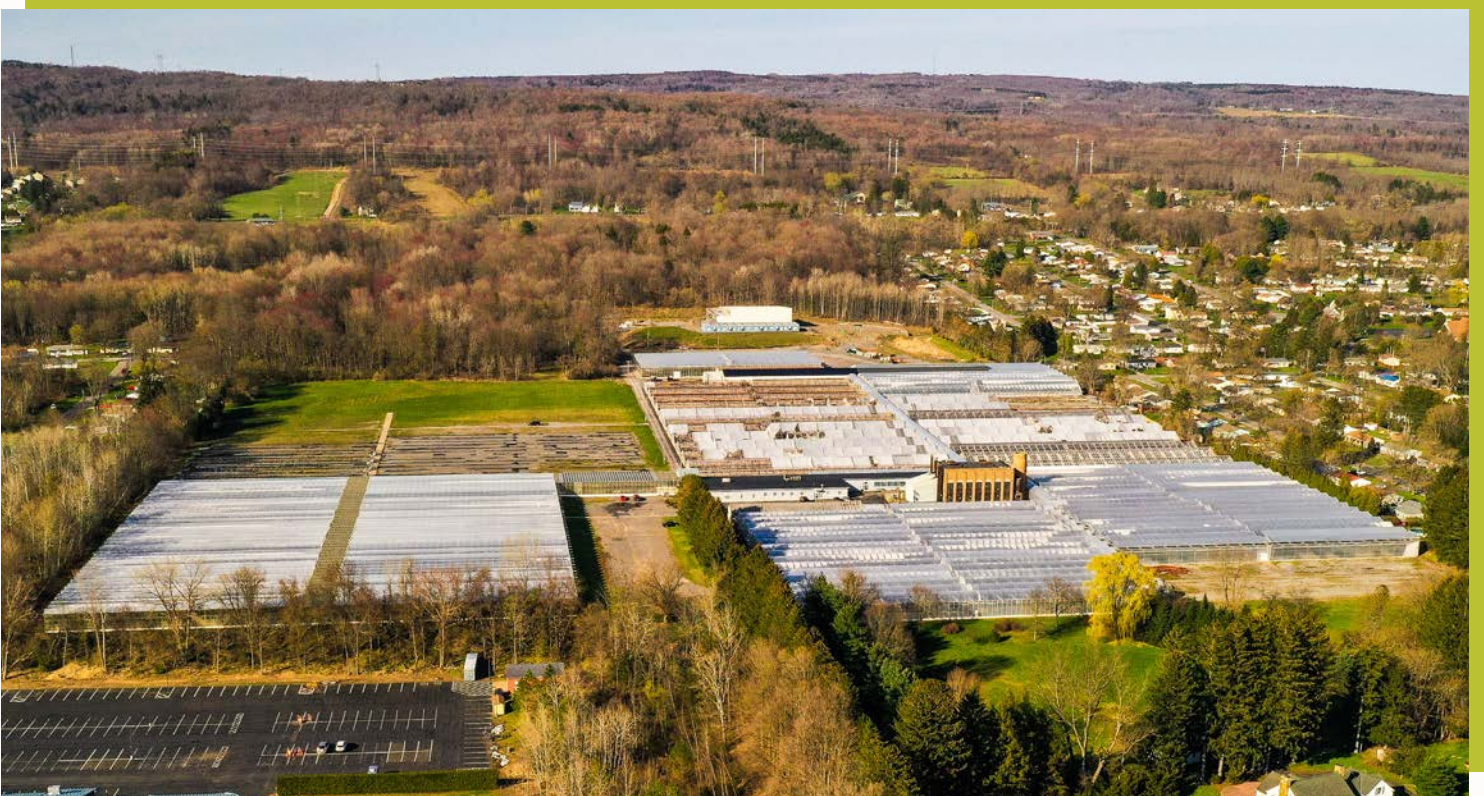
Aerial shot of 1113 Herkimer Road, Utica NY 13502